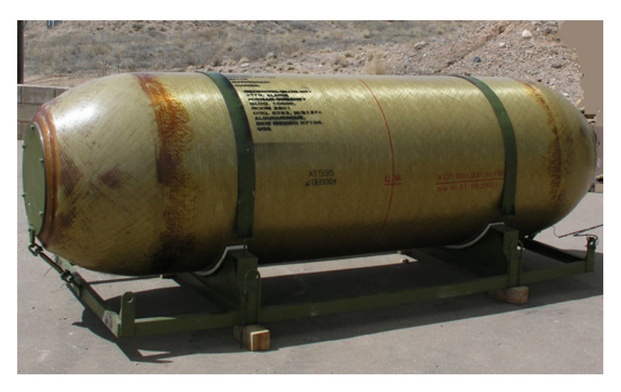
Figure 3. AT-595 delivered to Sandia National Laboratories

A picture of the AT-595 container is shown in Figure 3. This was the unit delivered to SNL as described in the paper section on Export Control.